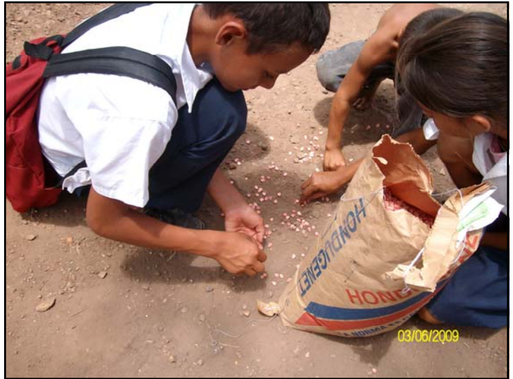
Children picking up spilled seeds